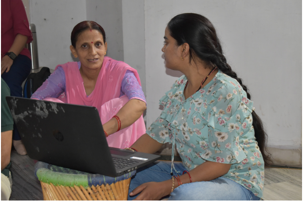
People shown their interest in ENVIS knowledge Products and activities