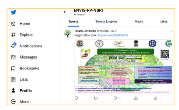
Snapshot of ENVIS-RP-NBRI Twitter Account