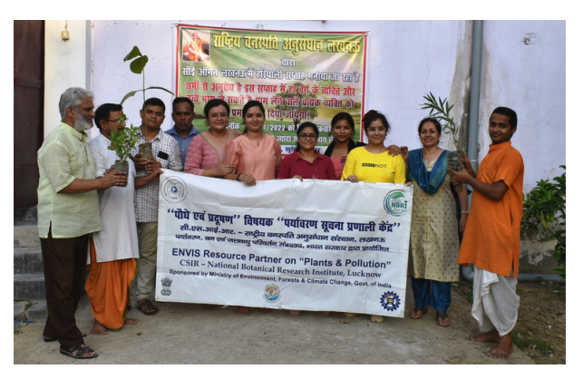
Successful completion of the event