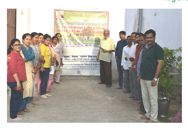
Team ENVIS along with general public