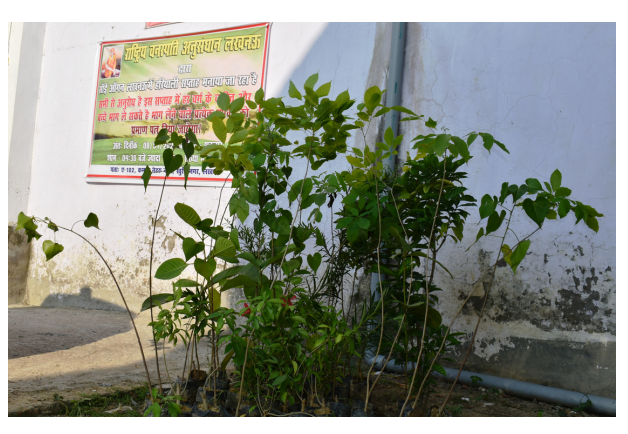
Plant Provided by ENVIS-RP-NBRI