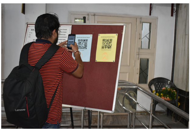
On spot Registration by a Participant